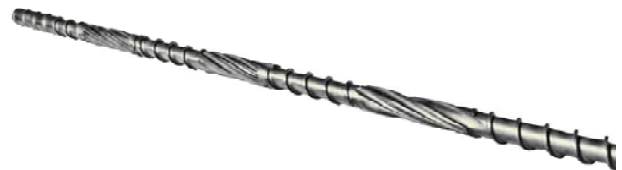
Fig. 3: Three Mixers On 36/1 Screw