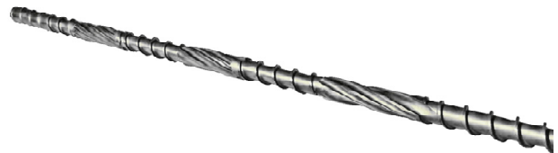
Fig. 3: Three Mixers On 36/1 Screw